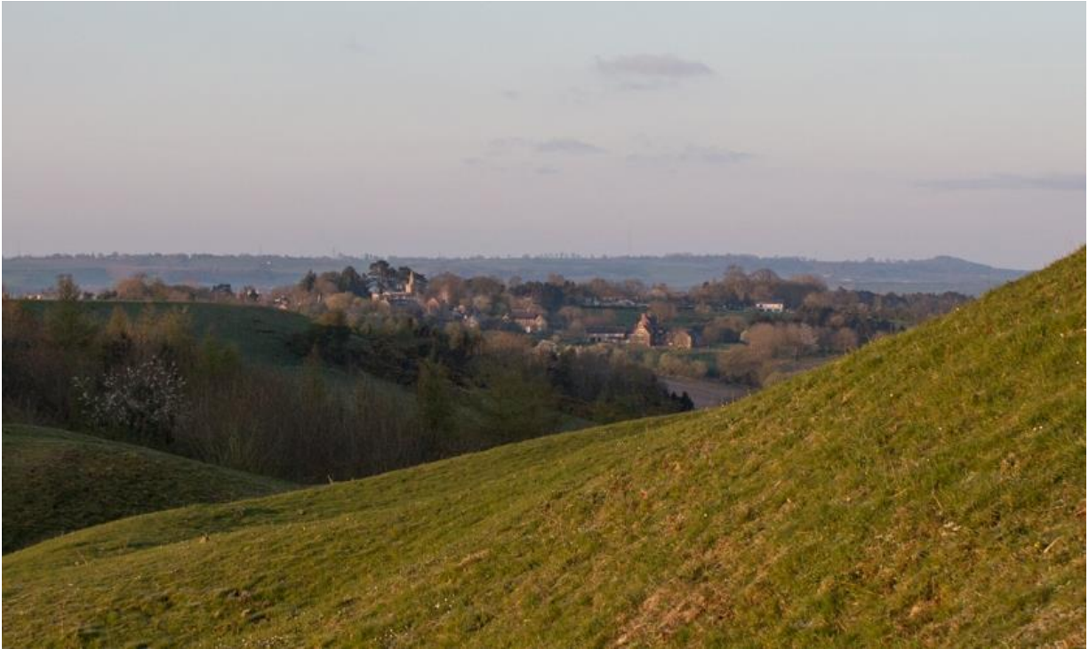
BV 3.2a View south-west of Burrough village from Burrough Hill Fort ramparts

(a) Panoramic view of Burrough village, historic landscapes and (b) Salters Hill and Burrough Hill Fort (SAM), The Limes and Cheseldyne house, both Grade II listed. Publicly accessible from Burrough Hill Fort ramparts, Kings Lane, Footpath D81 and bridleway D107 and D74a.