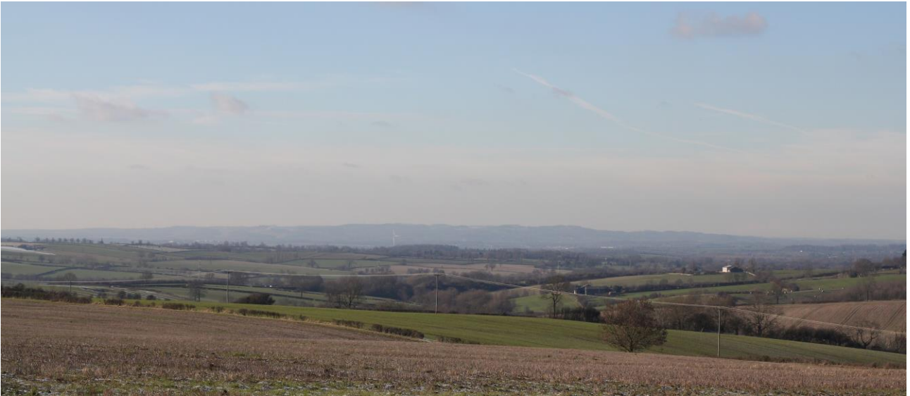
BV3.1 Sweeping view west towards Charnwood Forest

Sweeping view towards Charnwood Forest and the Wreake and Soar valleys from the escarpment at the west edge of Burrough-on-the-Hill village. Publicly accessible from the Twyford Road, Melton Lane and Footpath D70.