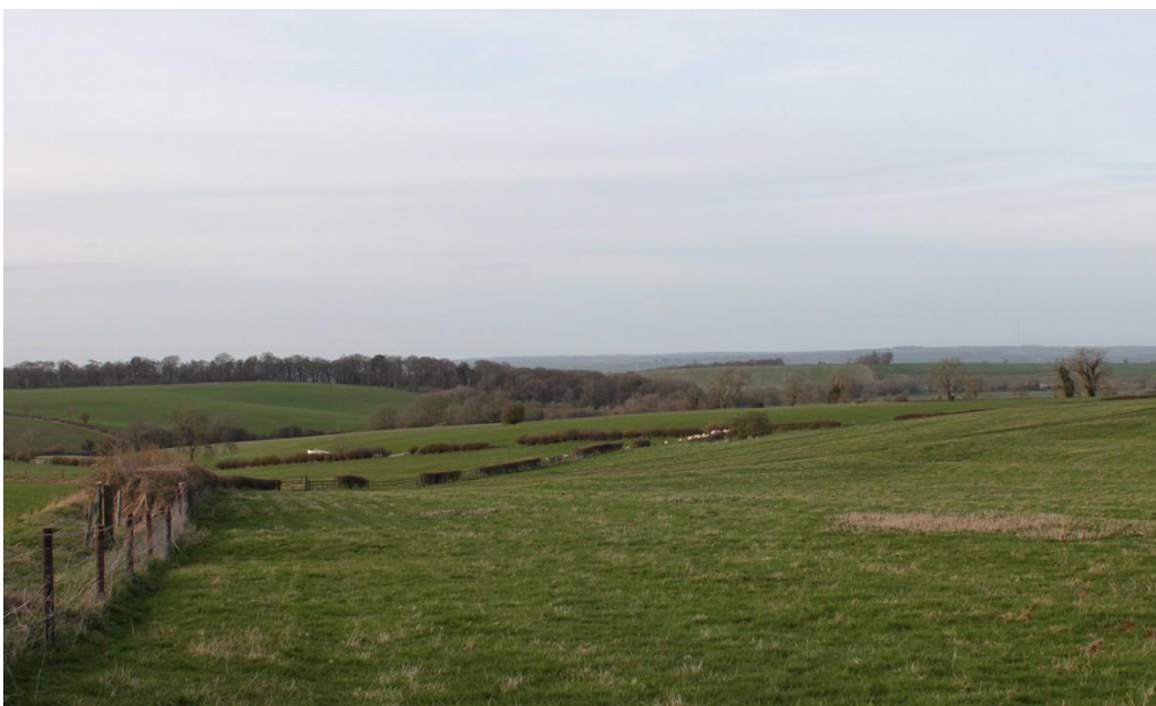
PV5.2 View north-west towards Little Dalby from Pickwell cricket field

Long view across Pickwell Cricket Field towards Little Dalby encompassing arable and ridge and furrow fields and Kyte Hill amongst other natural features with Waltham wolds in the distance. Publicly accessible from the Leesthorpe Road and the Leicestershire Round.