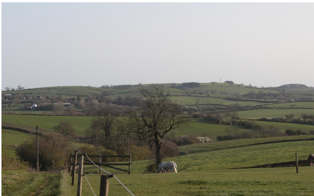
SV7.2b View south from Somerby

Further south (b) the prospect opens out across small pastures, ridge and furrow fields, scattered arable and farmsteads, Owston hamlet and Owston Wood SSI and the Scheduled Ancient Monument of Whatborough Hill. Publicly accessible from several viewpoints including the public bridleway (marked on OS map), Leicestershire Round and Footpath D74. There is also a long view back towards the Somerby ridge across Owston Abbey fish ponds (SAM), Washdyke Road, Owston.