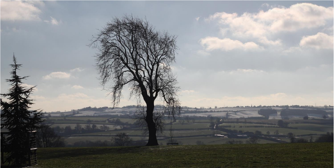
BV3.3 View south-east towards Tilton Ridge

View across Burrough House park land towards Newbold hamlet and Tilton ridge.