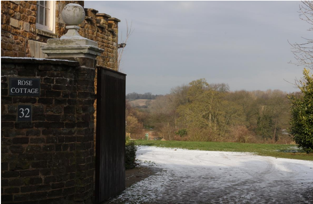
SV 7.8 View north of Somerby Hall Parkland from High Street

Views of Somerby Hall Park land, veteran trees, and pastoral fields from the north perimeter of Somerby village conservation area. Publicly accessible within Somerby village from porous spaces along the High Street, Mill Lane, the Leicestershire Round and Kathy's Pop-up Cafe, Rose Cottage, High Street.