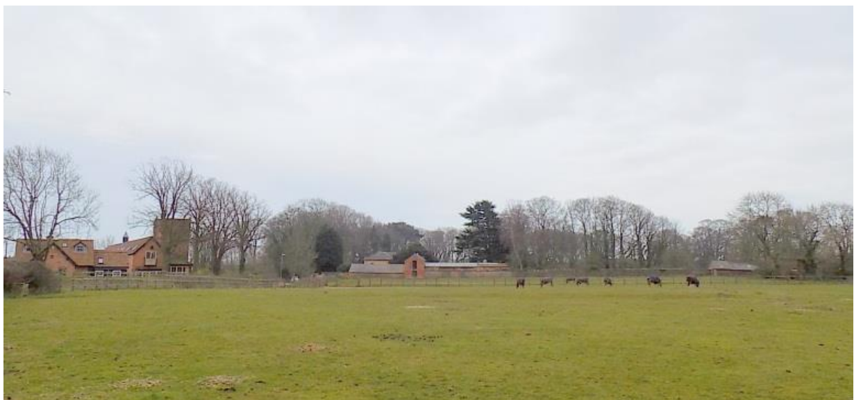
SV7.4 View south-east to northern edge of village conservation area

View of the historic Village Close bordered by a traditional assemblage of estate buildings at the north 'gateway' and entrance to Somerby conservation area. The view encompasses Grove Close, the expansive ironstone boundary wall of adjoining park land and trees behind, a row of out-buildings, including a Grade II glasshouse, Grove stables and landmark water tower and roof of the dwelling. Publicly accessible from the Burrough Road and Footpath D70 from where Somerby Grade I Church is also visible.