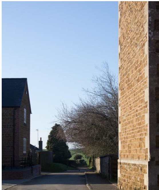
SV 7.3 View south along Manor lane to open countryside

View to open countryside and partial view of Grade II Manor Farmhouse publicly accessible from Somerby High Street and along the Manor Lane.