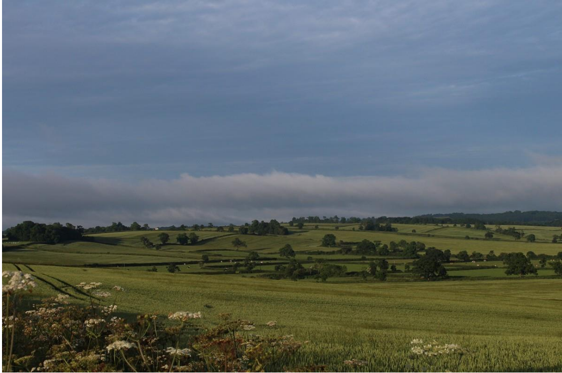
LV8 View south across Lower Leesthorpe dairy pasture towards A606

Panoramic view across Lower Leesthorpe dairy pasture, arable fields and Ash Pole Spinney towards the A606 and Leesthorpe. Publicly visible from Cuckoo Hill Lane and Ferneley's Dairy Barn Cafe, Whissendine Road.