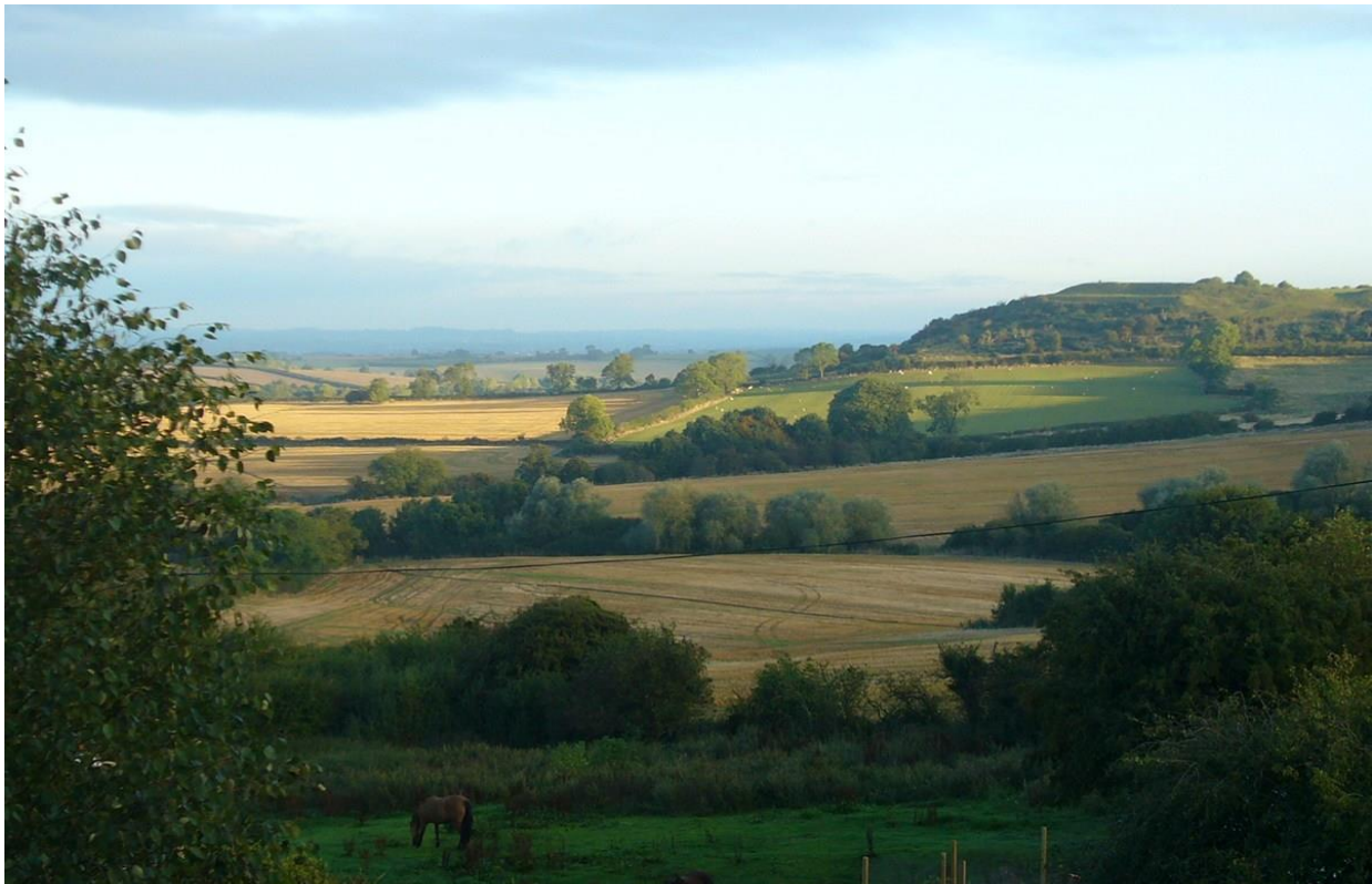
BV 3.2b View north-east from Kings Lane, Burrough, to Burrough Hill Fort