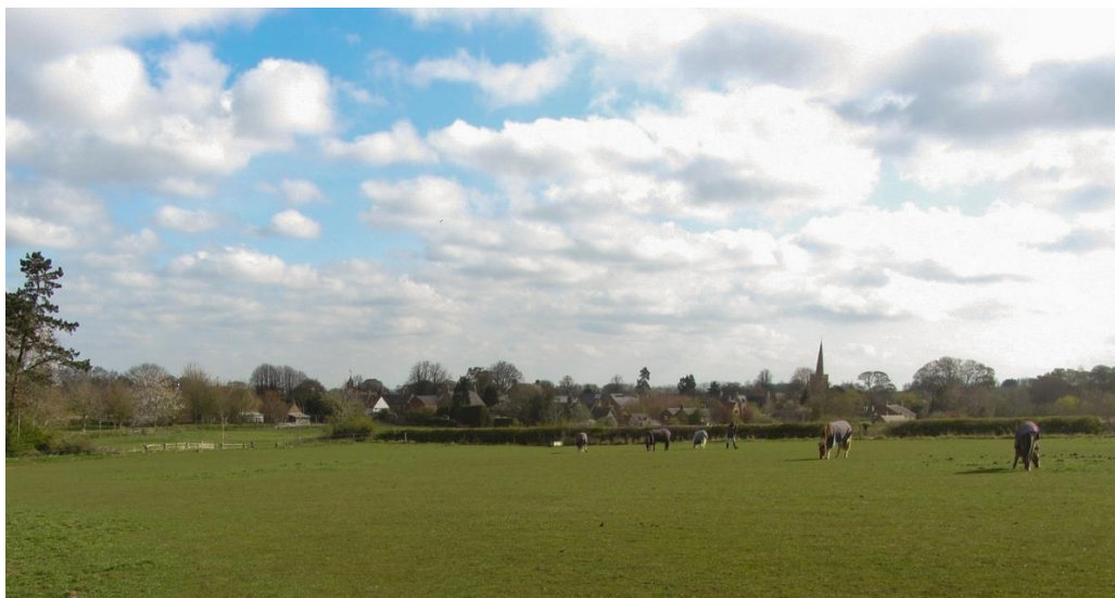
SV7.2a View north back towards Somerby

A classic panoramic High Leicestershire view from the high ridge at the southern perimeter of Somerby which encompasses the conservation area, a tranquil pastoral landscape, ancient monuments and archaeological sites. Features include (a) Grade I All Saints Church, Grade II listed buildings such as Manor Farm House, Somerby School and others, earthworks of Somerby medieval village (HER:MLE: 22781), Grove Park and veteran trees and their settings.