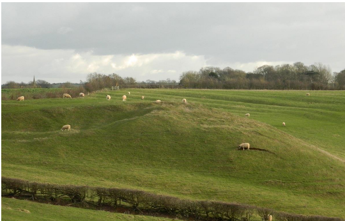
SV7.9b View east across old gravel pits, ridge and furrow fields, towards All Saints Church, Somerby