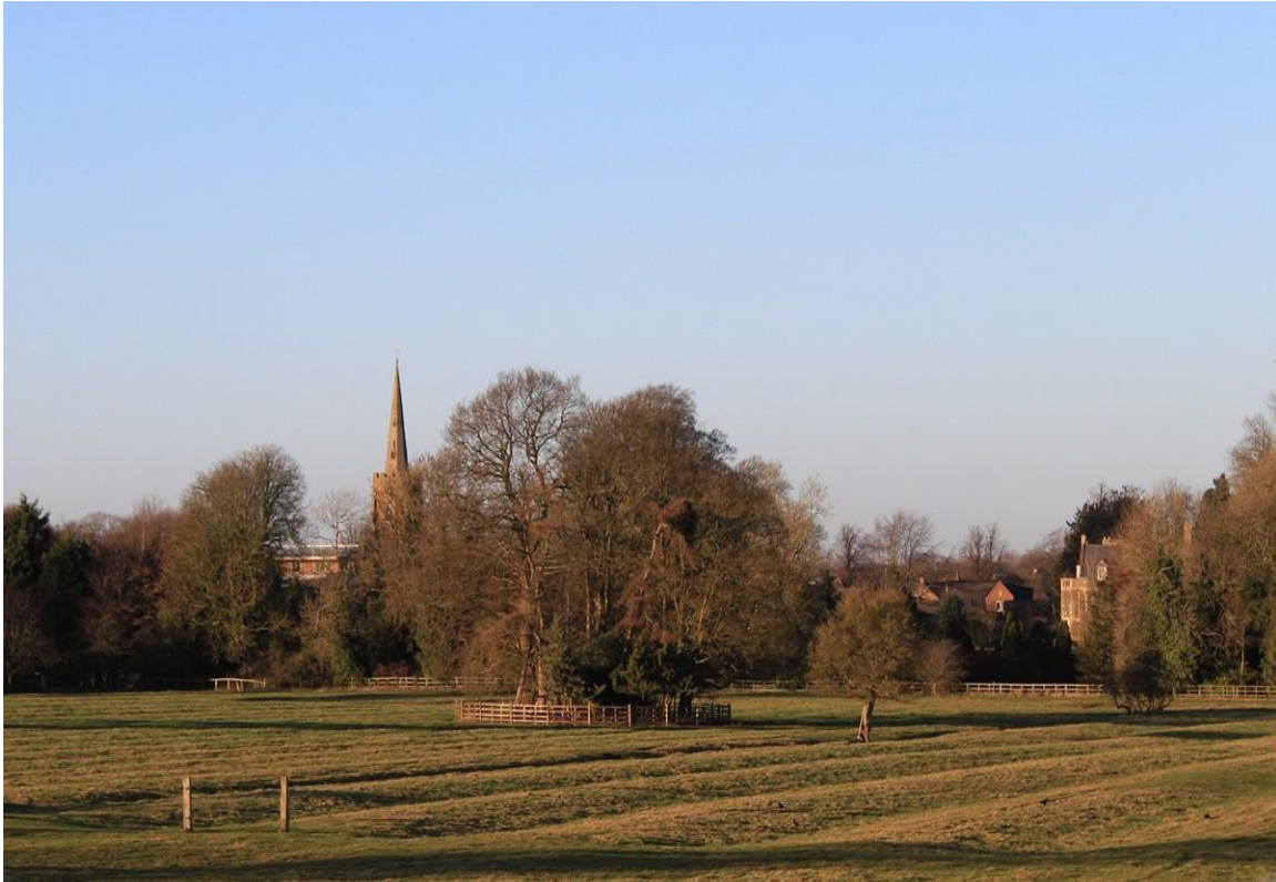
SV7.1 View northwest from Owston Rd towards Somerby

View of the southern edge of the Somerby village conservation area across ridge and furrow fields and including disused water tower 'eye-catcher', Grade I All Saints Church tower and spire and Grade II Somerby House. The view is publicly accessible beginning at the rise of the Owston Road as the road approaches Somerby and from Footpath D74.