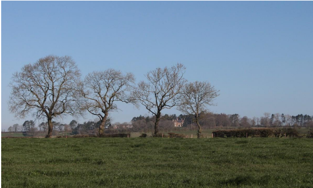
SV7.7a View north-west to Burrough Hall from footpath D72

Expansive view across grazing fields towards (a) Burrough village, Hall and park with the spire of Grade I St. Peter's Church spire, Tilton in the distance; and (b) south towards Owston. Publicly accessible from the Newbold Lane and Footpath D72.