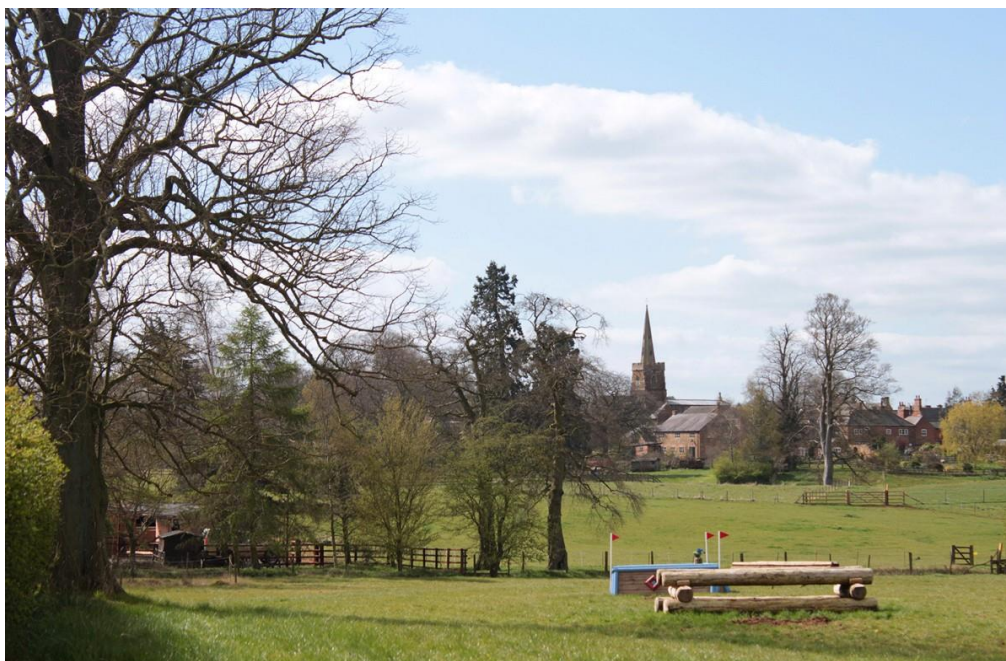
PV 5.3 View south-west across Somerby Hall parkland towards Somerby conservation area

View across Somerby Hall landscaped park land to Grade I All Saints Somerby Church and Somerby conservation area. Publicly accessible on Footpath D68, the Leicestershire Round and partially from above the hedge line along the Pickwell Road.