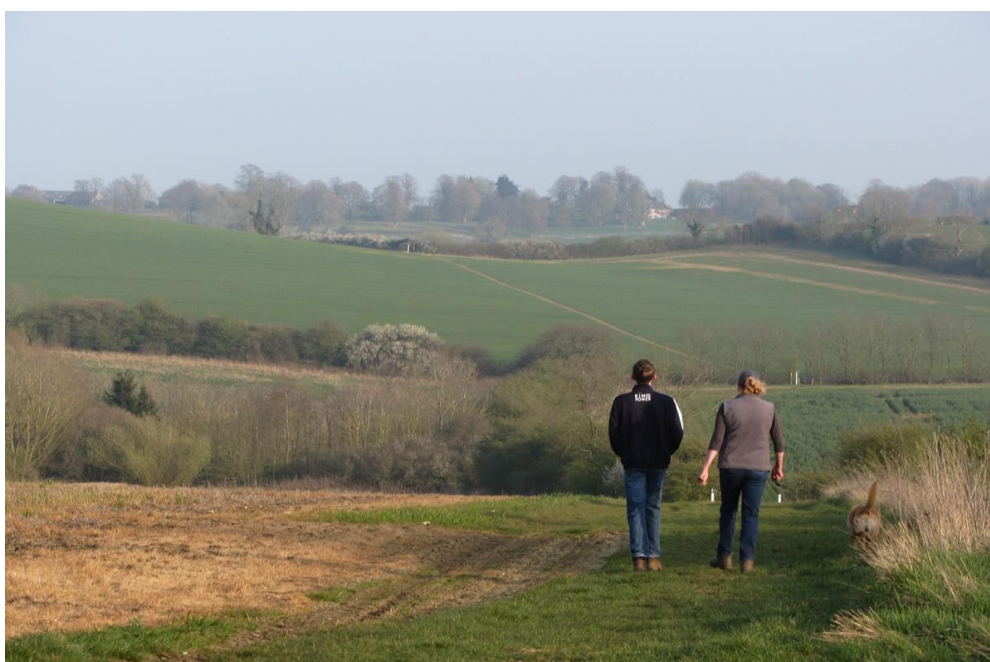
PV 5.4 View of rolling pastureland south-east towards Cold Overton from Pickwell back-slope

Expansive view of open skyscape, rolling pasture, wood and arable land from the high back-slopes of Pickwell village encompassing, Cold Overton, Whissendine windmill (Rutland). Publicly visible from Footpath D68, Bridleway D78 and a permitted footpath.