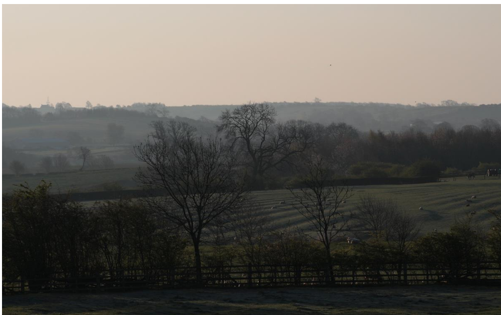
SV 7.6 Sweeping view east towards Pickwell

Sweeping view towards Pickwell and Stygate Lane across woodlands, rolling fields and in the long view sections of Somerby Hall Park. Publicly accessible from Burrough Hill, the start of the Jubilee Way, Burrough Country Park.