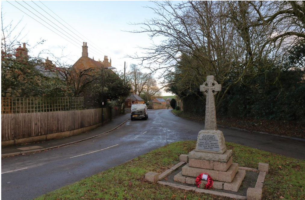
PV 5.1 View east along Main Street to countryside beyond village

View east through the village Main Street to countryside encompassing the WWI Memorial green triangle, Grade I All Saints church yard, Grade II Pickwell Manor home farm buildings, vernacular dwellings and mixed deciduous and cherry tree plantation. Publicly accessible from Pickwell Main Street.