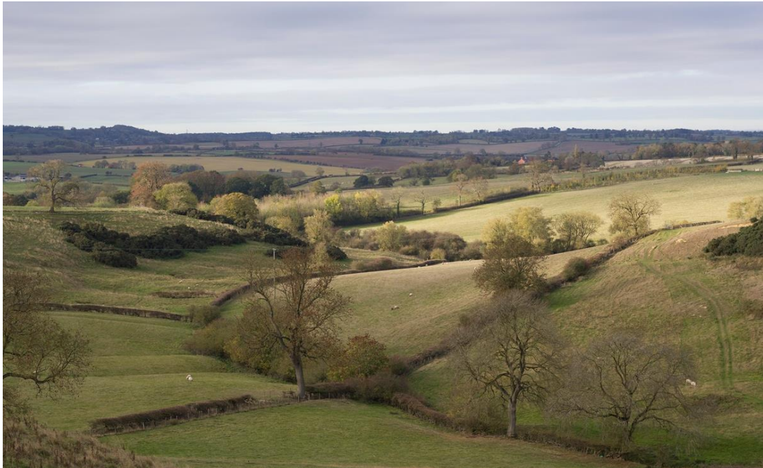
SV7.9a View south-west from Burrough escarpment across open countryside

Sweeping vista across (a) open countryside including the geological landslip of the Burrough Hill escarpment and (b) old gravel pits, ridge and furrow fields and (south) the Somerby Grade 1 listed All Saints' Church. Publicly accessible from Footpath D70.