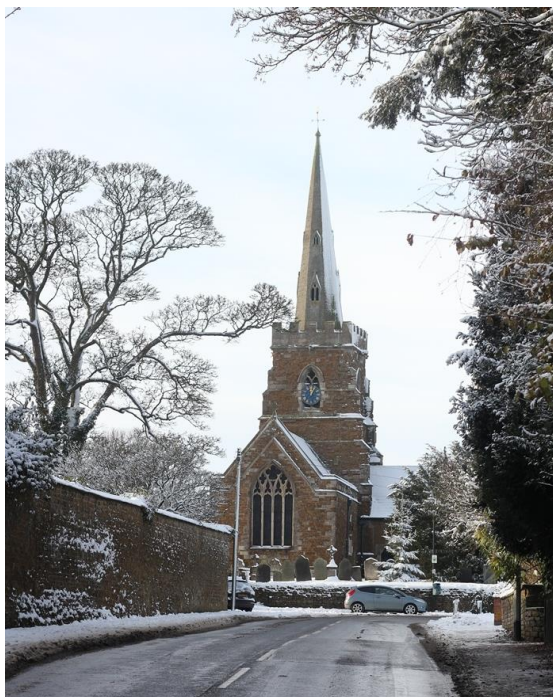
SV 7.5 Traditional view, west along Somerby High Street

A traditional village view including a Grade II manor house, Grade I church, the village green and locally characteristic ironstone estate boundary wall publicly accessible at the southern entrance to Somerby High Street.